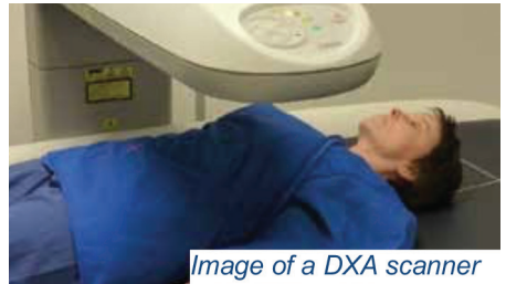
Image of a DXA scanner

We will ask you to lie in various positions so that the scanner can take images of different parts of your body.