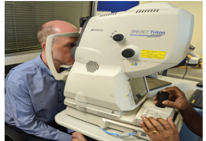
Image of an optical coherence tomography machine