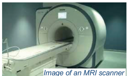
Image of an MRI scanner