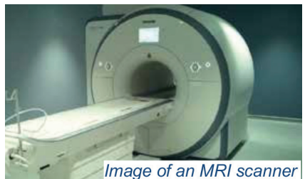
Image of an MRI scanner

We will ask you to lie flat on your back (with your legs supported) on a comfortably padded table that gently glides you into the scanning tube. You will be given a pillow on the MRI heart scanner, but will need to be able to lie flat without a pillow on the MRI brain scanner.