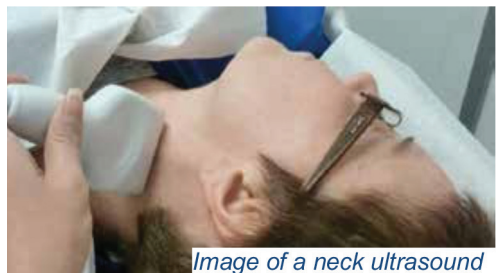
Image of a neck ultrasound