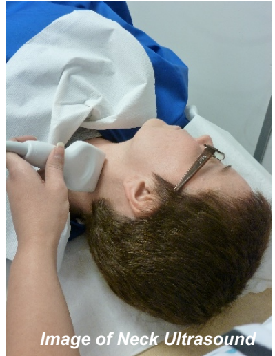
Image of Neck Ultrasound

We will ask you to tilt or turn your head as we move the probe over the entire length of both sides of your neck.