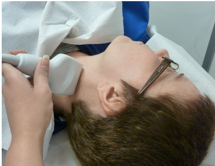
Image of a neck ultrasound