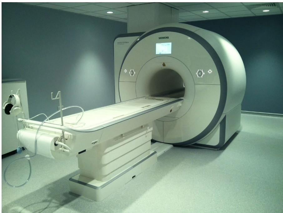
Image of an MRI scanner